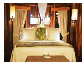
Garden Tropical bure