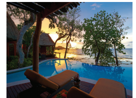
Villa private pool