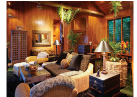
Dream House living room